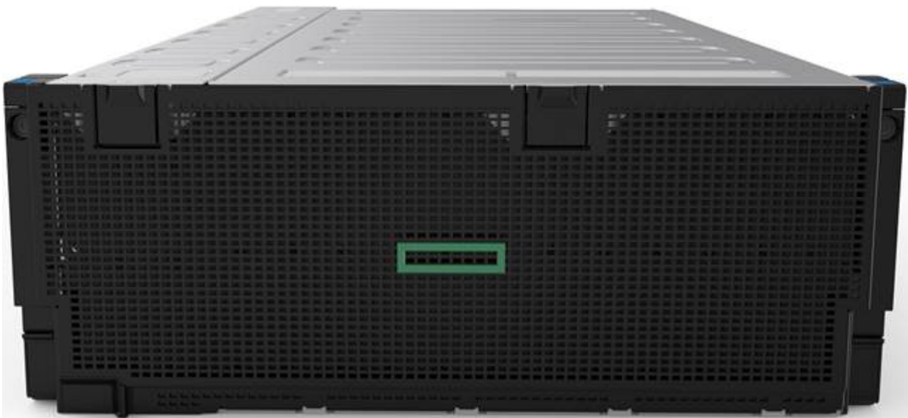
HPE D8000 Disk Enclosure Front View

The D8000 Disk Enclosure can be connected to ProLiant Gen10 servers using the HPE Smart Array E208e-p SR Gen10 Controller or the P408e-p SR Gen10 Controller, which includes HPE Apollo and HPE StoreEasy. Two D8000 enclosures can be daisy-chained together to provide support for up to 212 drives.