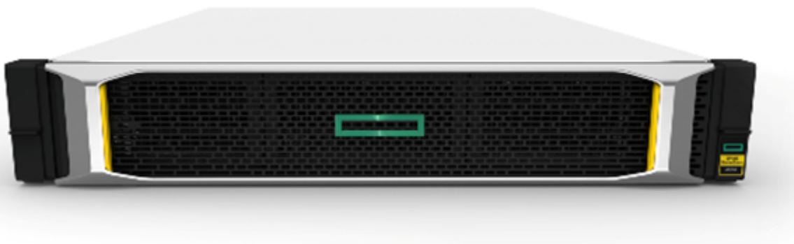
HPE MSA 2052 SAN Storage