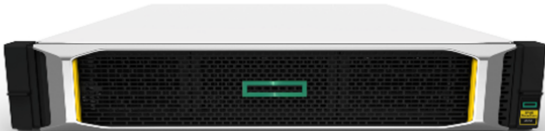
HPE MSA 2050 SAN Storage